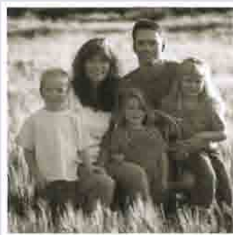
MENTAL HEALTH CLINIC