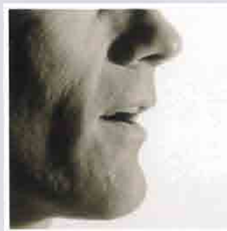
SPEECH AND LANGUAGE CLINIC

BYU COMPREHENSIVE CLINIC 241 JOHN TAYLOR BUILDING (TLRB) 1190 NORTH 900 EAST PROVO, UT 84602